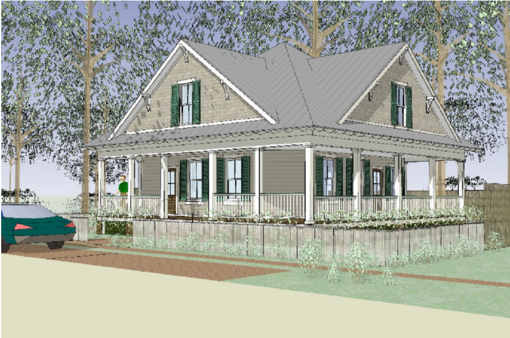
Cottage 3 Street Perspective View The Cottages at Yellow Bluff