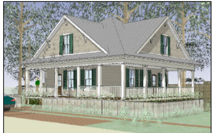
Street Perspective View